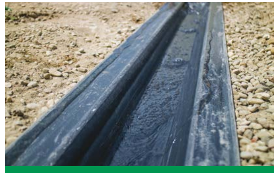
Vinyl culvert covered with GlideWax® shield