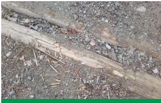
Wooden culverts cleaned one month ago

The vinyl open-top culverts are covered with the GlideWax® shield using specially selected metal oxide nanoparticles, to enhance the hydrophobic properties of the profile surface. Thanks to the GlideWax® shield the open-top culverts clean themselves of sand, small stones and other material carried by the rainwater or vehicles wheels.